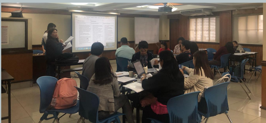
Standard Setting activities for Grades 5 and 6 English, Science, and Math held from April 29 to June 7.