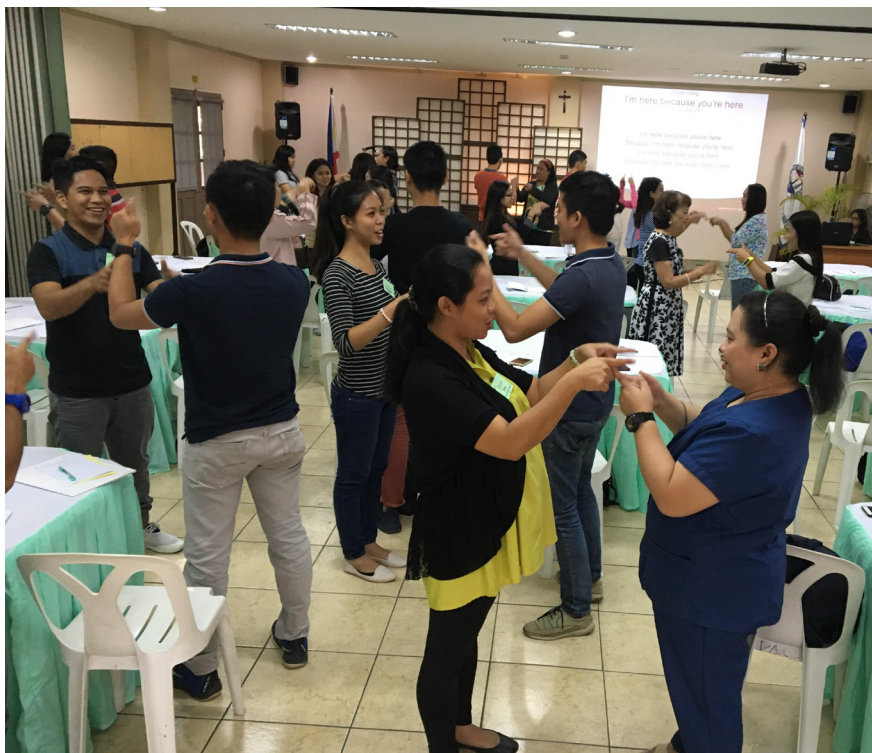
Seminar-workshop on 'Developing Classroom Management Skills' for CEM Member schools in the Davao Region