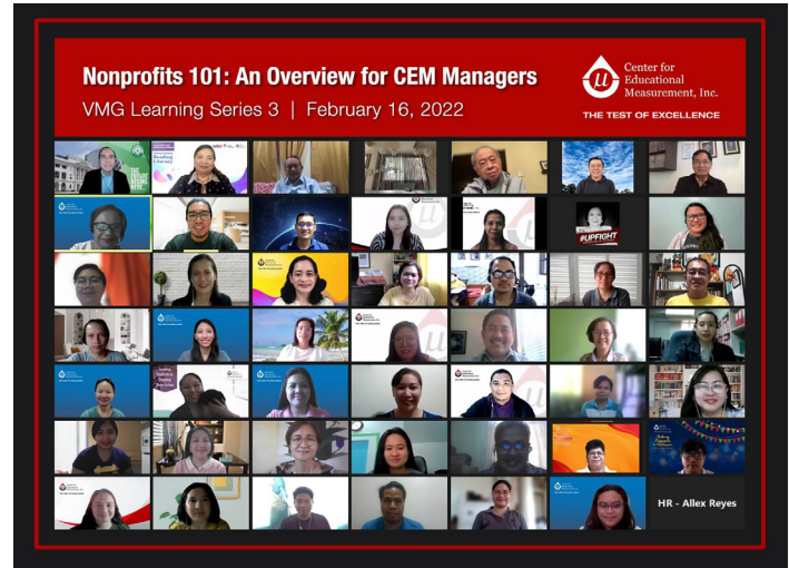
Participants - CEM heads and staff from various divisions and sections.

The CEM VMG Learning Series is part of the organization's long-range programs and planning strategies aimed at promoting the sustainability of the company.