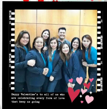
Valentine's Day Selfies