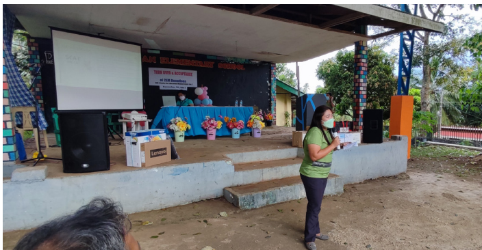
CES teacher leading the mock storytelling exercise