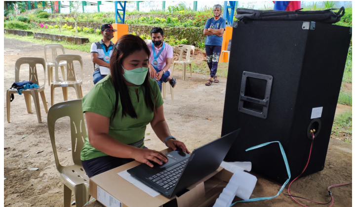
Teacher from Cabagna-an Elementary School (CES), La Castellana, Negros Occidental checking out donated laptop

Watch the audio-visual presentation of the activity HERE .