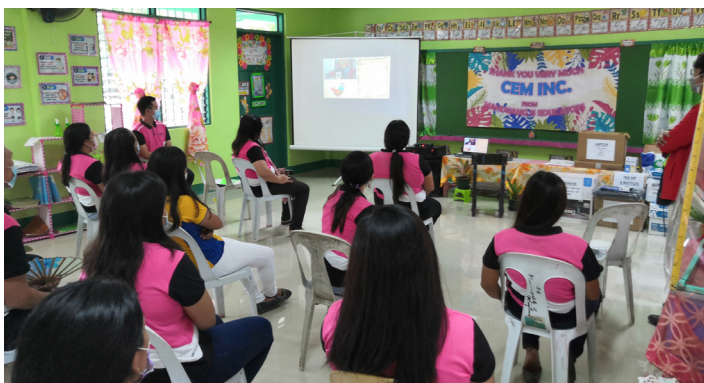
Teachers from Manduang Integrated School (MIS), Minglanilla, Cebu watching the CEM digital reading resources