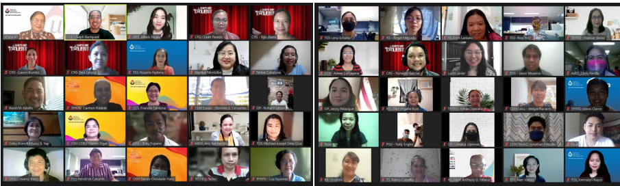
CEM staff during the general assembly

Towards the end of the program, CEM paid tribute to all employees who have achieved another milestone in the organization.